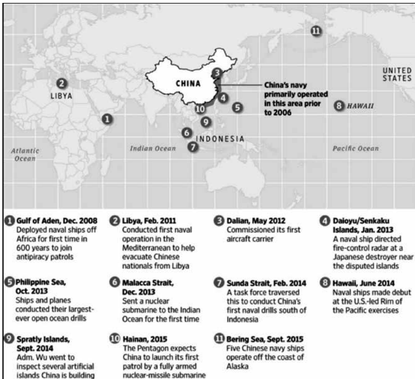
Fig 1: China's Naval Global Expansion 16

Fig 1 shows the global outreach undertaken by the PLA Navy since 2008. The figure helps in understanding the growth that is