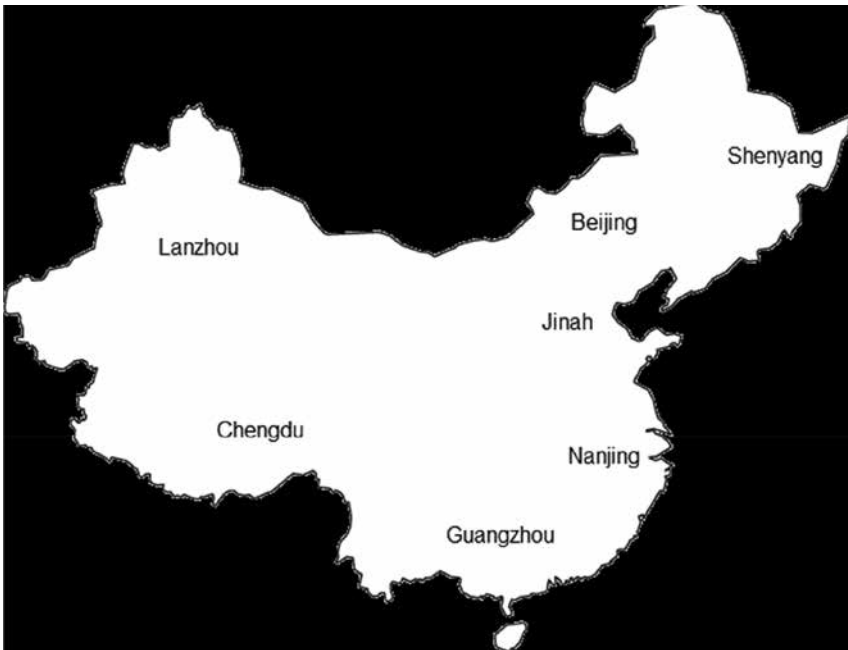
Fig 3: China's Current Military Regions

Therefore, due to the existing stable environment in its landmass China has been focussing on its maritime strategy, since from a geo-strategic perspective, eight countries among China's nine neighbouring countries around its territorial waters have a marine territory dispute with China, hence, the need for maritime expansion