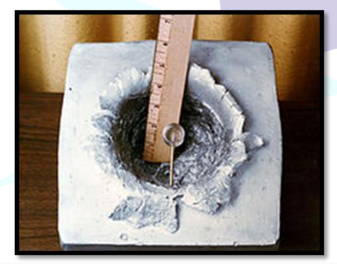
Figure 2: A 7 gram object (shown in centre) shot at 7 km/s (23,000 ft/sec) (the orbital velocity of the ISS) made this 15 cm (5 7/8 in) crater in a solid block of aluminium.<sup>11</sup>

More than 5, 00,000 pieces of space debris encompassing both natural (meteoroids) and manmade debris (defunct satellites, their parts and debris resulting from deliberate or accidental collisions) are presently tracked as they orbit around the earth at the average speed of 7.8 km/s. Of these, approximately 20,000 pieces of debris are in excess of 10 cm in size. In addition there are millions of pieces of debris that are very small sized and cannot be tracked. While the larger pieces of debris can be tracked and evasive action can be initiated, the smaller pieces of debris have now become major cause of concern as even a fleck of paint can potentially damage a space asset. The satellites and spacecraft can obviate catastrophic damages to some extent by incorporating protective shielding. The damage that a collision, the design of the spacecraft, and the geometry of the collision.<sup>10</sup> The extent of damage to a thick aluminium metal sheet carried out in laboratory conditions by a 7 gram projectile fired from a light gas gun and travelling at speed of 7 km/s is depicted in figure 2. Taking into consideration the enormous station size of ISS, one can well visualise the fallout of debris collision threats.