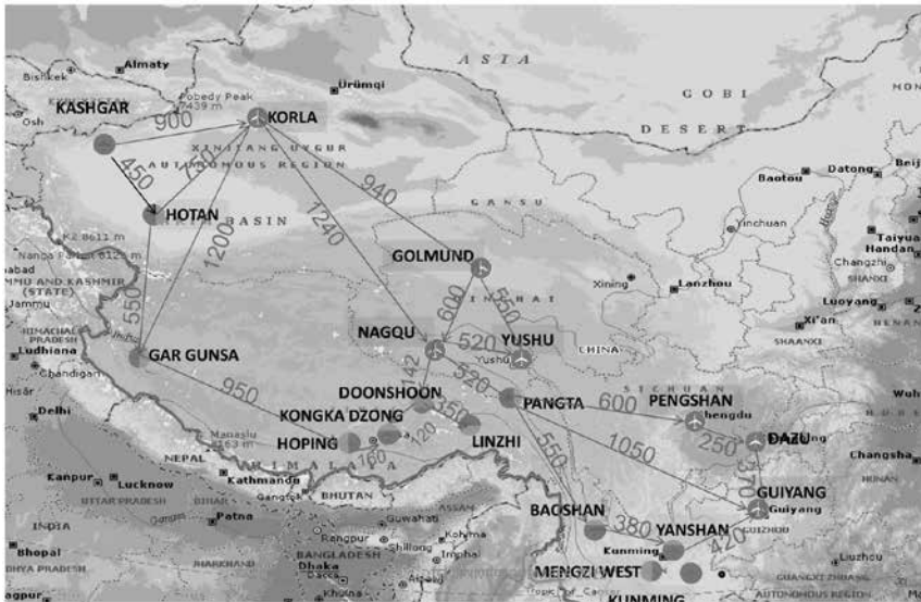
Fig 1: Distances in km between Airfields in Tibet and Adjoining Areas

Note: Distances in km between Airfields in Tibet and adjoining Areas, Author's own. Map not to scale.